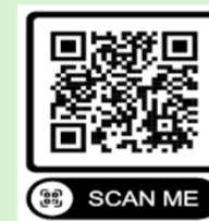
5 little men in a flying saucer