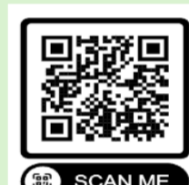
Counting to 10