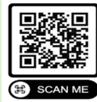
Five little ducks