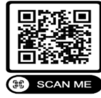
Five cheeky monkeys