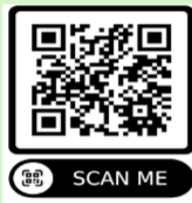
Five little speckled frogs