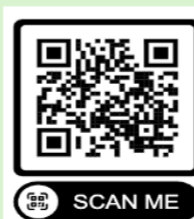
Counting to 10 forwards and backwards