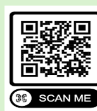
Counting to 20