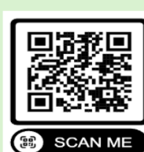
Counting back from 20