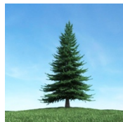
Pine – evergreen

Evergreen trees keep their leaves all year. Their leaves usually look like needles.