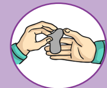
Pulling and pinching the clay with your fingers