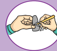
Creating holes or hollows in the clay with tools