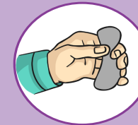
Squeezing the clay