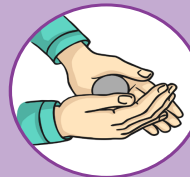
Rolling a ball of clay