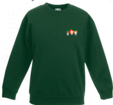
Reception to Year 5