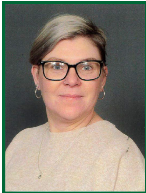
Miss Best Teaching Assistant