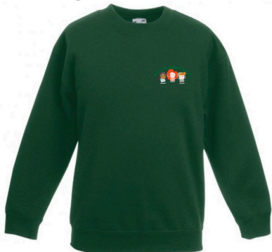
Reception to Year 5